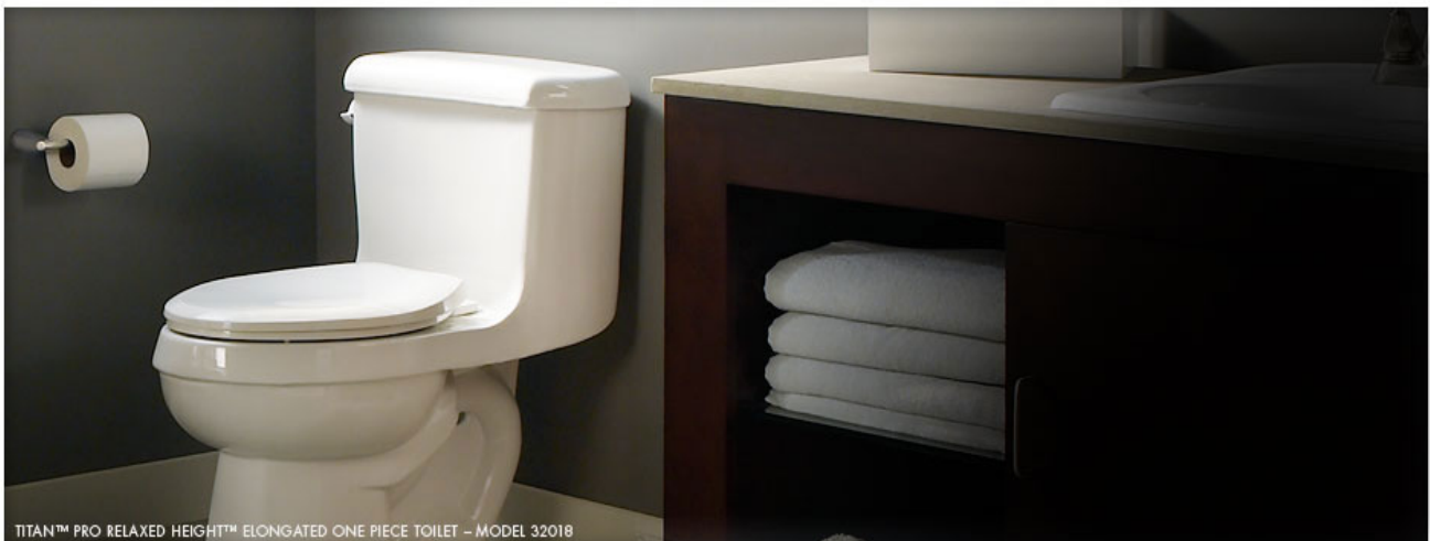
TITAN™ PRO RELAXED HEIGHT™ ELONGATED ONE PIECE TOILET – MODEL 32018